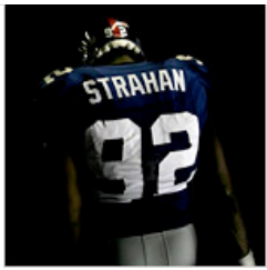
Going Out On Top, On Time