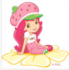
Characters Reimagined for the 21st Century