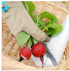
When Money Is Tight, Banking on Gardening